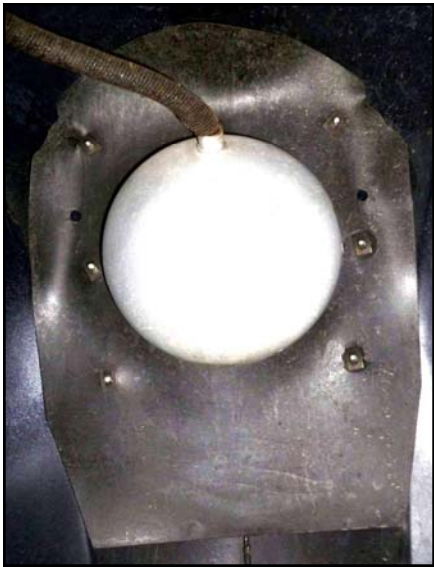
Rubber headlamp shield

It is a good bet that few Sharknose owners are aware that surrounding each headlamp bucket a rubber shield was installed inside the front fender to keep mud and dirt, etc. from fouling the lamps. Over the years these shields fell off. Owners may have wondered why seven double-ended studs are found around each bucket. The shields are part number 87361 and the 3/4" 8-32 studs are part number 87465. 11/32" nuts are centered on the studs. The rubber is retained by flat nuts part number 87364 which grip the extended threads on the double-ended studs. The rubber is very stiff and cracks easily (perhaps due to age) and is about 1/16" thick.